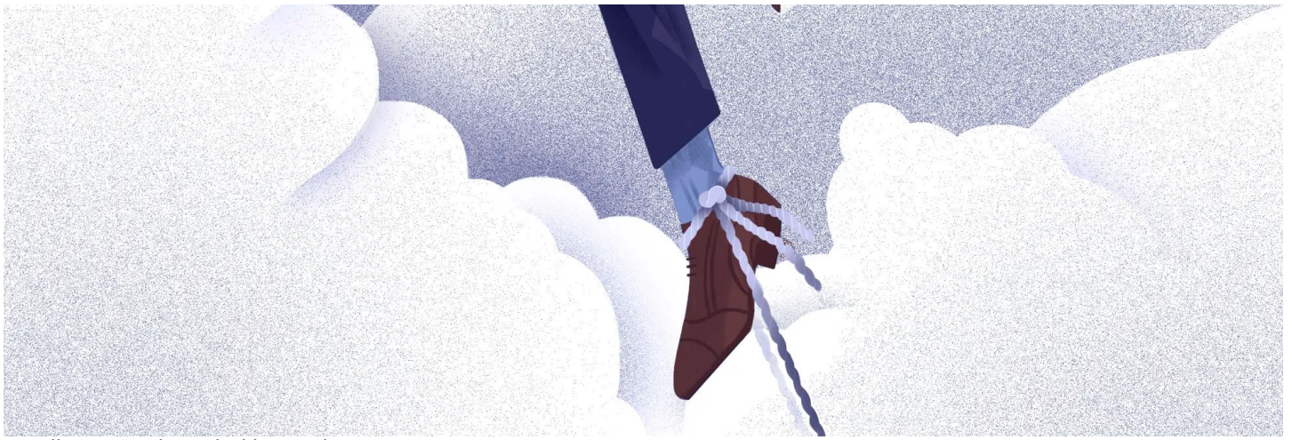
Illustration by Rebekka Dunlap

“ W e’re going through!” The Commander’s voice was like thin ice breaking. He wore his full-dress uniform, with the heavily braided white cap pulled down rakishly over one cold gray eye. “We can’t make it, sir. It’s spoiling for a hurricane, if you ask me.” “I’m not asking you, Lieutenant Berg,” said the Commander. “Throw on the power lights! Rev her up to 8,500! We’re going through!” The pounding of the cylinders increased: ta-pocketa-pocketa-pocketa-pocketa-pocketa . The Commander stared at the ice forming on the pilot window. He walked over and twisted a row of complicated dials. “Switch on No. 8 auxiliary!” he shouted. “Switch on No. 8 auxiliary!” repeated Lieutenant Berg. “Full strength in No. 3 turret!” shouted the Commander. “Full strength in No. 3 turret!” The crew, bending to their various tasks in the huge, hurtling eight-engined Navy hydroplane, looked at each other and grinned. “The Old Man’ll get us through,” they said to one another. “The Old Man ain’t afraid of Hell!” . . .